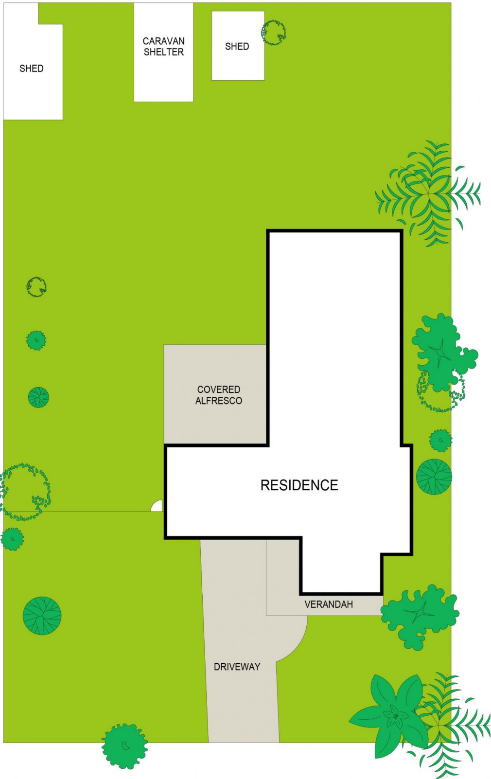
SIT PLAN (NOT TO SCALE)