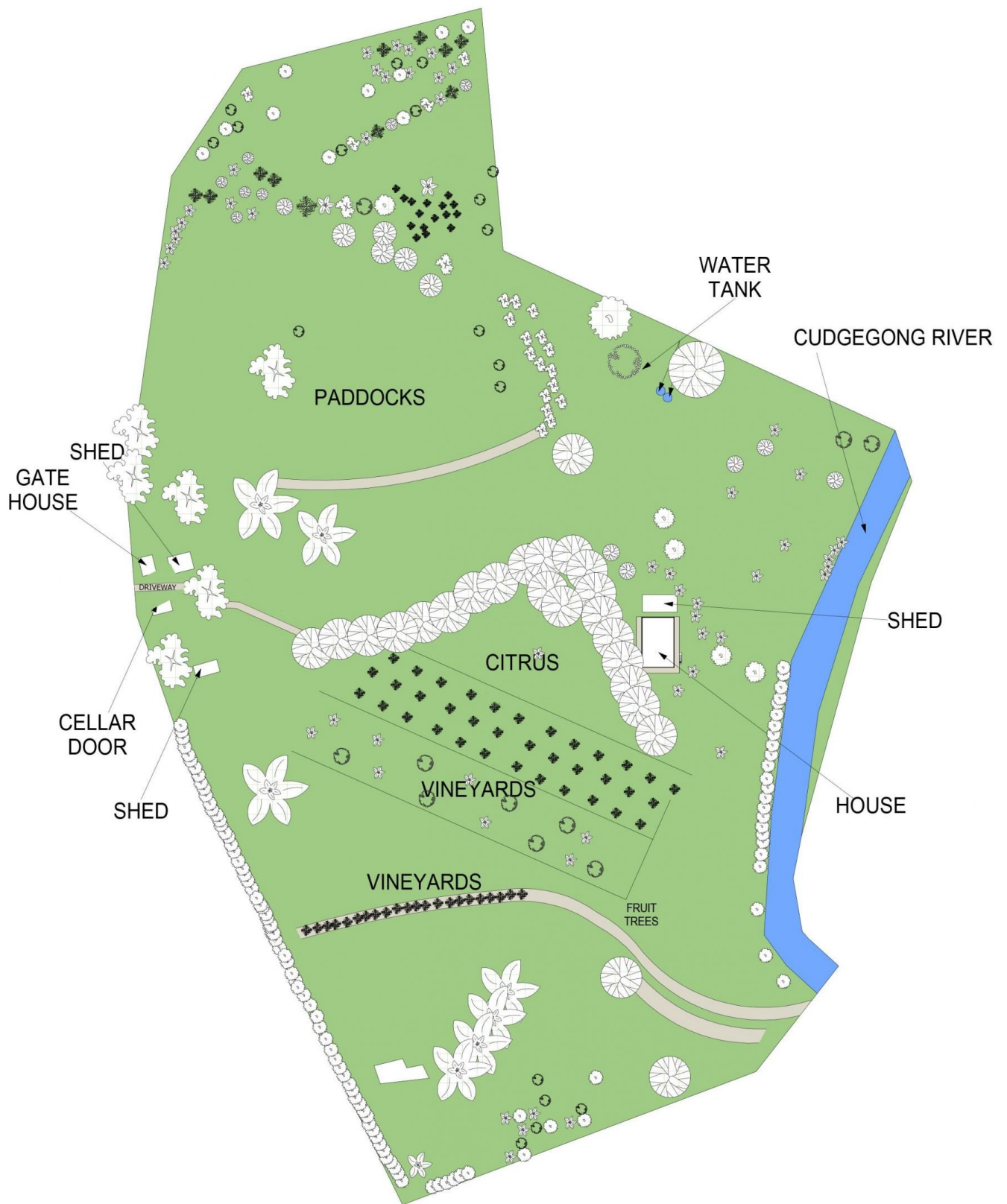
SITE PLAN ( NOT TO SCALE)